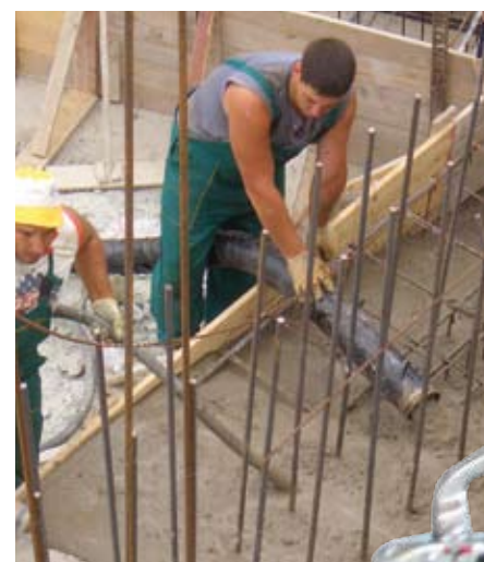
... or for pumping fine concrete of up to 16 mm. Because of the self-sealing and adjusting ring, you can even use them for liquid screed (right-hand picture).