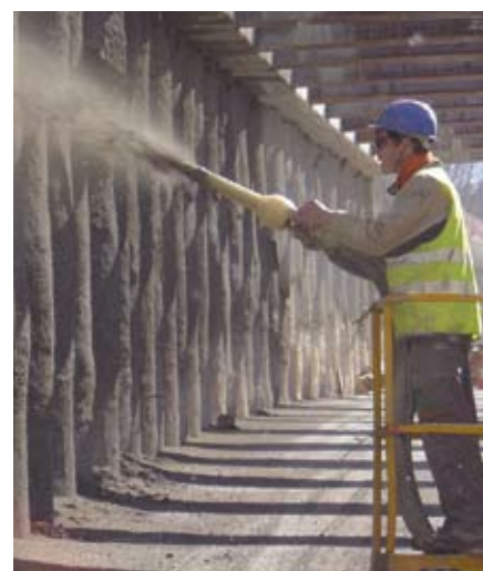
Fine concrete pumps like the P 715 are one of the most versatile of systems. You can use them for shotcrete ...